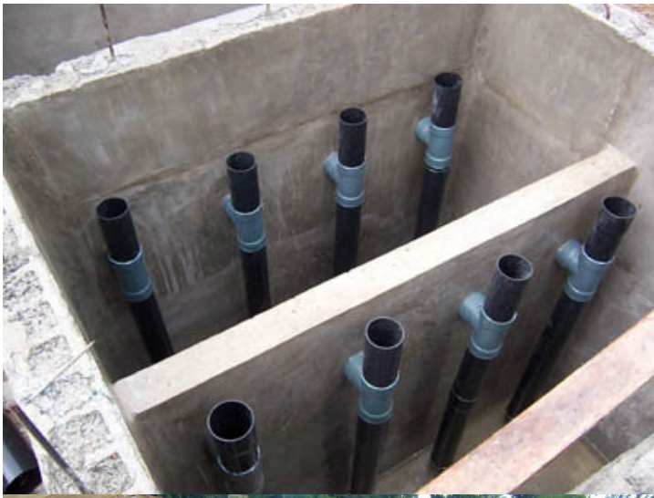
INSIDE THE BAFFLE REACTORS